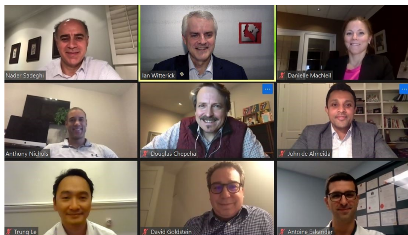
WORKSHOP: Surgeon Lead Clinical Trials