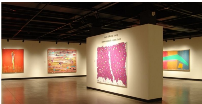
Beaverbrook Art Gallery