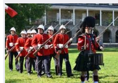
Historic Garrison District