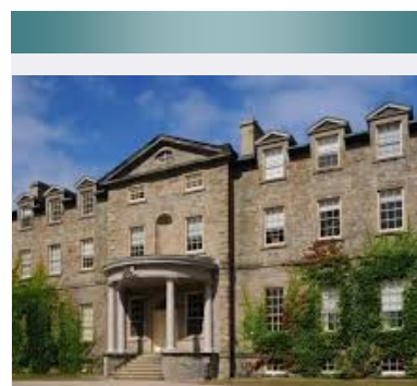
Old Government House