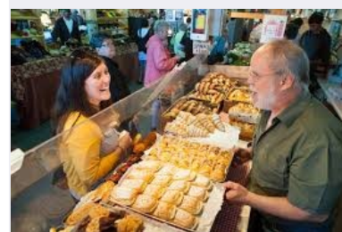
Boyce Farmers Market